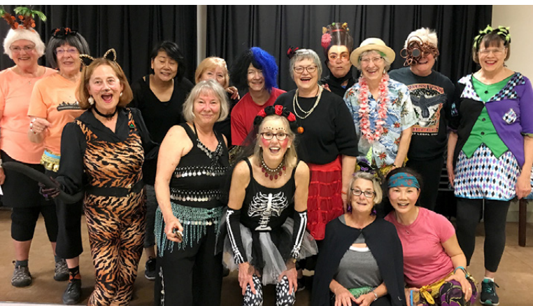
Greenwood Senior Center's Zumba class enjoy Halloween fun.