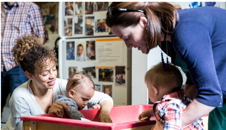
Phinney Neighborhood Preschool Co-op offers play-based learning for infants-age 5.