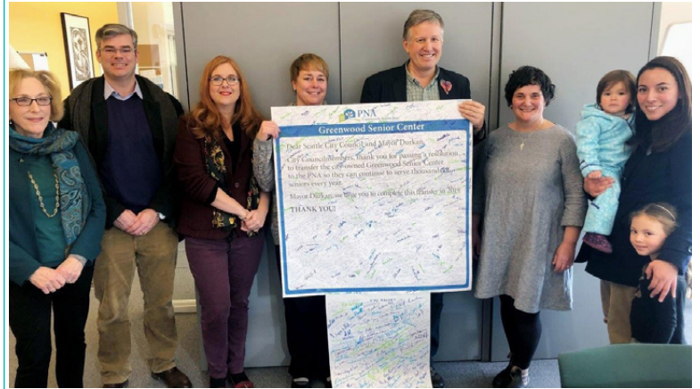
Staff and board advocate for the Greenwood Senior Center with a petition at City Hall