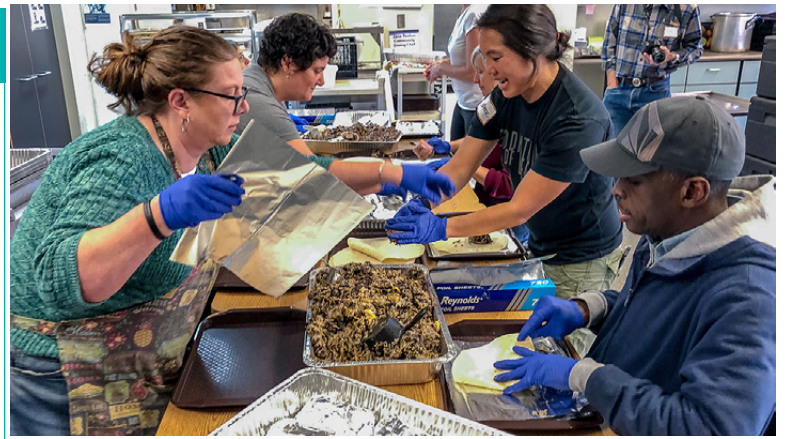
Burritos Without Borders volunteers makes 350 burritos at a time for people experiencing homelessness.